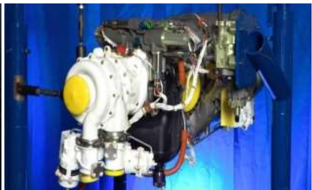
Photo of the Power & Thermal Management System (PTMS) made by Honeywell Aerospace in Mississauga, Ontario.